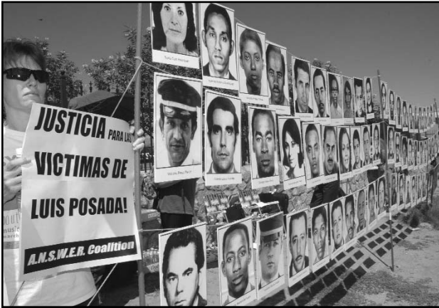
El Paso protest, Aug. 2005, in front of immigration court. The display is the 73 plane-bombing victims murdered by Posada.

Luis Posada Carriles is a long-time admitted and convicted terrorist, trained by the CIA in explosives and sabotage to carry out attacks on Cuba. He is responsible for the murder of 73 people in the 1976 bombing of a Cuban airliner, and for Havana hotel bombings in the 1990's that killed an Italian tourist. In the 1970s, as an official in the DISIP, Venezuela's "intelligence" police, he tortured and murdered Venezuelan activists. In Panama, Nov. 2000, he led a group of terrorists to try to assassinate Fidel Castro with 33 pounds of C-4 explosives, which if successful, would have also killed hundreds of students where Castro was due to speak.